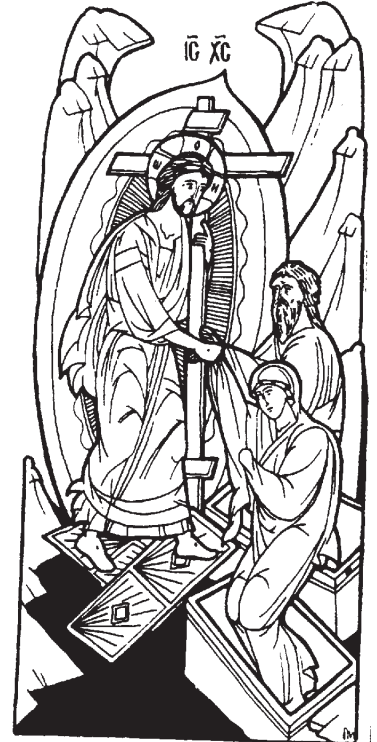
Icon of the Resurrection

May these words of Saint Basil bring peace to your heart as you confirm and celebrate the truth that Christ is Risen! Christ is alive! Alleluia!