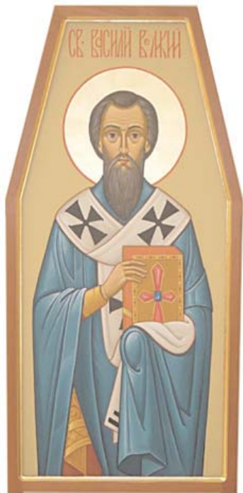
Saint Basil the Great

In preparation for our Centennial Celebration in 2010-2011, we will include in each edition of Gladsome Light a segment of the history of the Sisters of the Order of Saint Basil the Great, beginning with Saint Basil the Great, and continuing until we reach the present day.